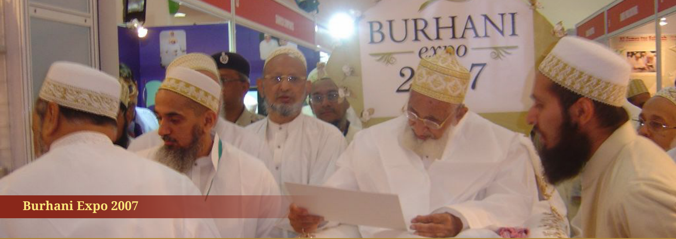
Burhani Expo 2007