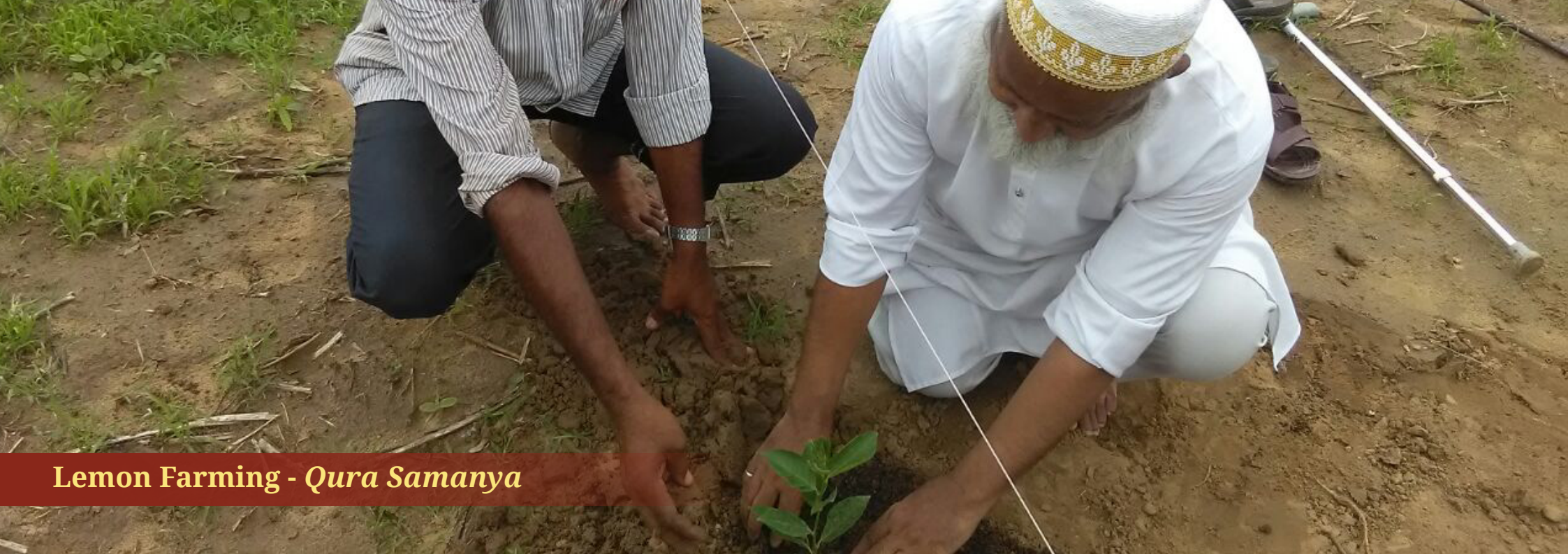
Lemon Farming - Qura Samanya