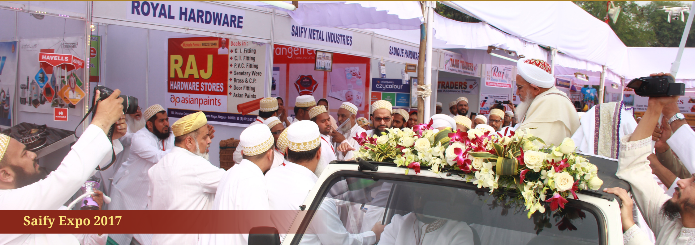
Saify Expo 2017