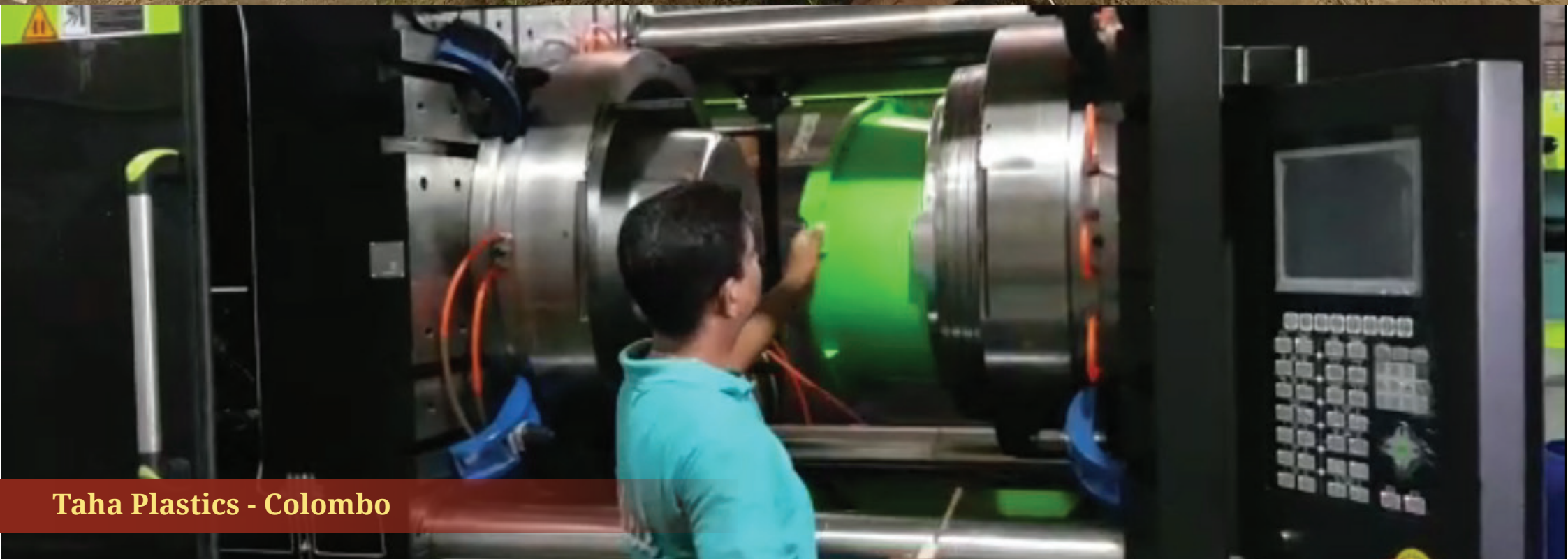
Taha Plastics - Colombo